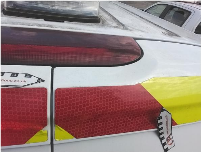
3: Door osr Dented Over 30mm