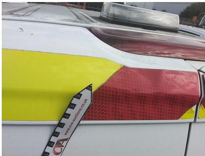
2: Door nsr Dented Over 30mm