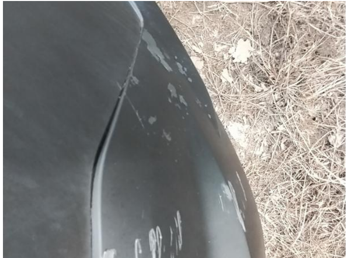
4: Bumper Rear Scratched Over 100mm Thru Paint