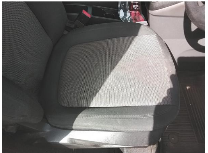
6: Seat Base Cover osf Soiled Heavy