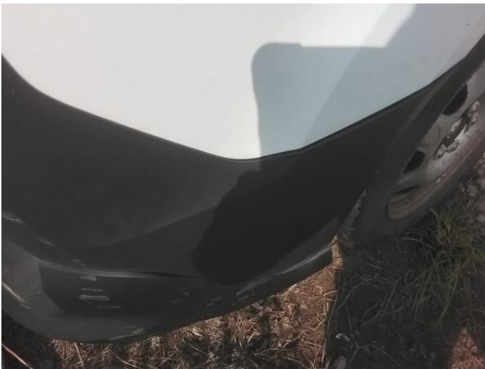
5: Qtr Panel Moulding os Scuffed (Unpainted) Over 100mm