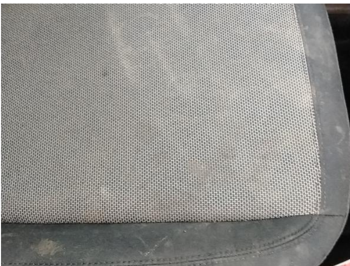
7: Seat Base Cover nsf Soiled Heavy